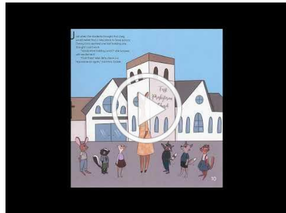
The Perfect Place