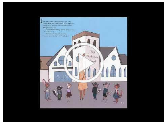
The Perfect Place

You can see each of the bird houses as well as the story book on display in Krueger Hall. You can also watch this delightful story here in a simple read aloud video narrated by our own Carley Walker.