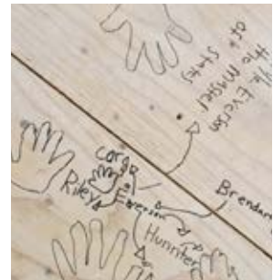
Above: Notes of love and encouragement written on the sub-floor during the remodel to bless all who enter.

In everything we do we will love first; God, each other, and our neighbors. - Our Mission