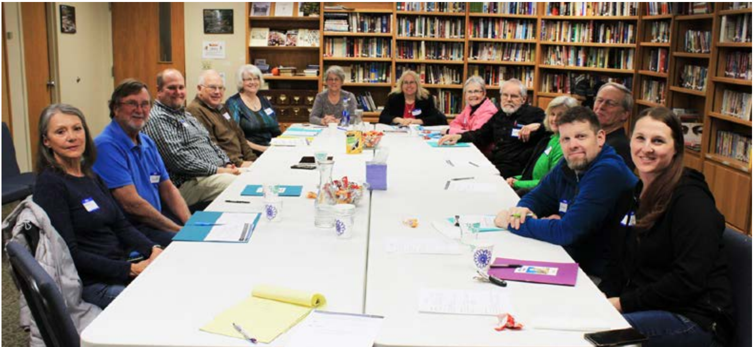
Above: The simply delightful spring 2018 LOVE1st 101 class.