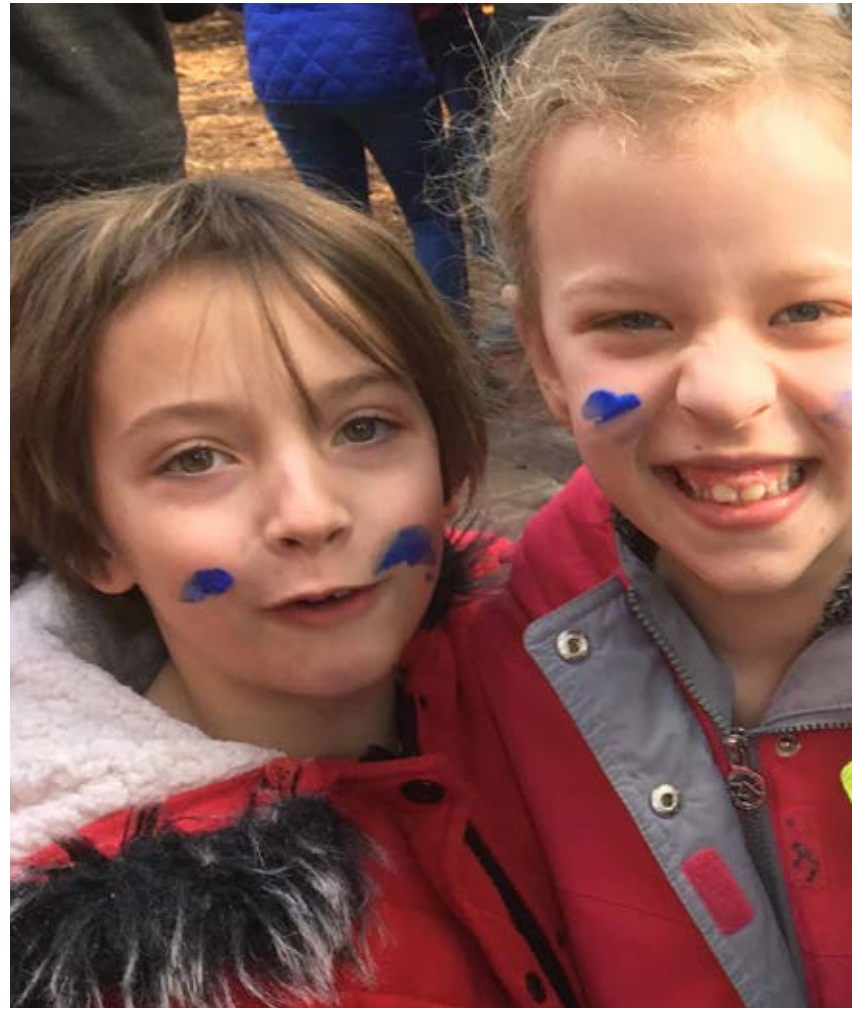
Left to right: at Camp VBX, learning to be fishers of fish. New friends and painted faces at Camp Lutherhaven. Opposite page: Ms Lou loses a bet.