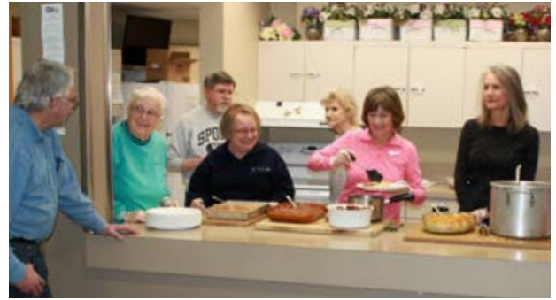
Above left: Two recipients of prayer shawls from the Knitting for Warmth group sent this picture. Above middle: The Breakfast Bunch hard at work preparing a delicious meal for the church. Above top right: Joining the choir is a great way to make friends. Above lower right: Preparing to serve a free lunch to members of the community.